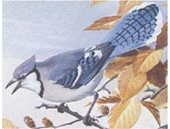
Tities Blue Jay