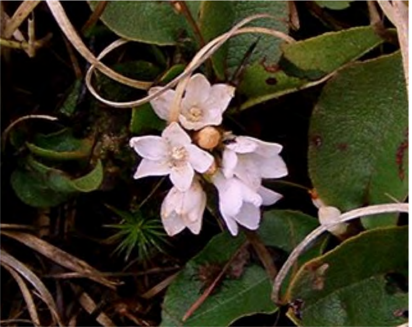
Siwkw ika'q. Wasuekl poqji-saqliaq.